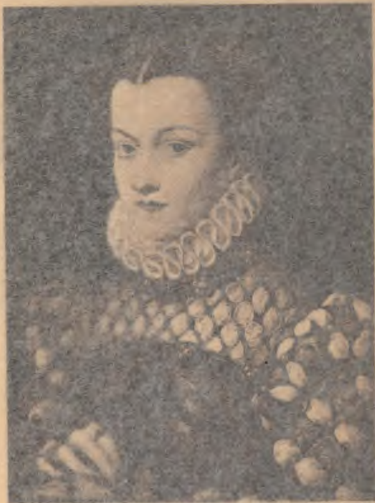
Countess of Castile wife of Charles II.